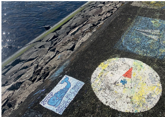
Our mural in Horta, alongside an RCC members' earlier one

For our last day on the island, Bill hired a car and we drove to the caldera , and hiked around its perimeter, enjoying the stunning scenery and luscious vegetation as we went. The blue hydrangea bushes which lined every field and road were visible like a patchwork from the top of the volcano, demonstrating why Faial is nicknamed the 'blue island'. After enjoying the hubbub of activity at the Peter Sport Café that evening, and waving goodbye to Bill the following morning, we headed back to sea to get to Santa Maria in time for the RCC Meet. As we continued southeast on starboard tack, we were