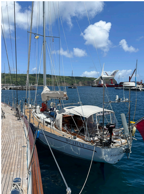
Swaraj alongside Nostramo, in Horta

All the while we were fed with fresh yoghurt and freshly baked bread, focaccia